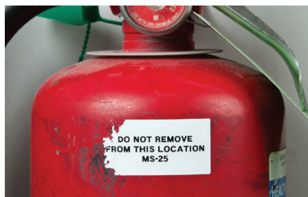
Tamper Indicating Labels