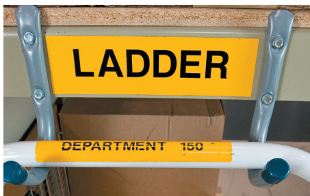
Visual Workplace Labels