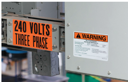
Arc Flash Labels