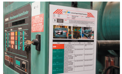
Visual Lockout Procedures