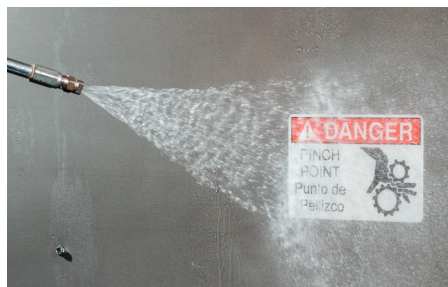
Wash-Down Resistant Labels