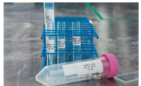
Lab Identification Labels